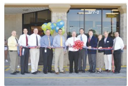
Food Lion 377 W. Jackson St. Cookeville, TN 38501 (931) 528-8934