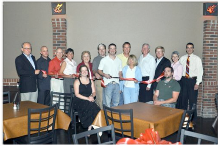
CHAR 14 South Washington Ave. Cookeville, TN 38501 (931) 520-2427