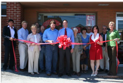
Caliber Computer, LLC. 203 Reagan St. Cookeville, TN 38501 (931) 520-7800