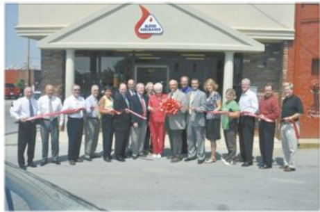
Blood Assurance 155 W Broad St. Cookeville, TN 38501 (931) 526-3462