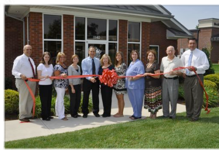
Putnam Physical Therapy 1140 Perimeter Park Dr. Cookeville, TN 38501 (931) 526-2345