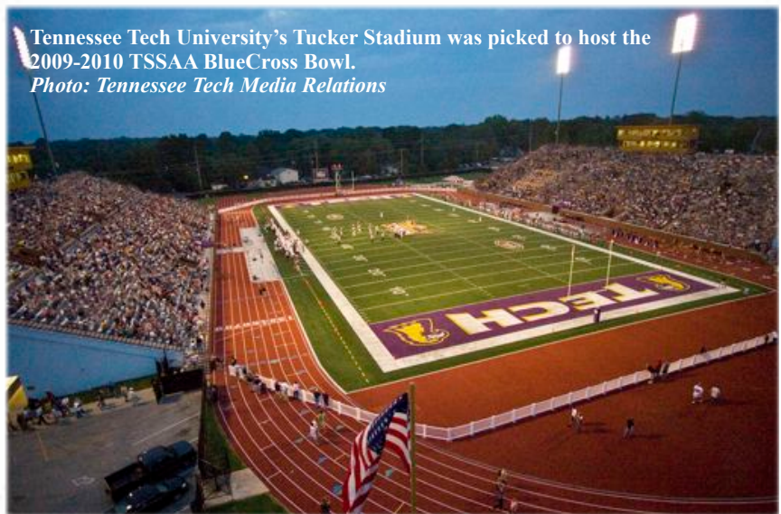
Tennessee Tech University's Tucker Stadium was picked to host the 2009-2010 TSSAA BlueCross Bowl.

Cookeville lands 2009-2010 TSSAA Football Championships