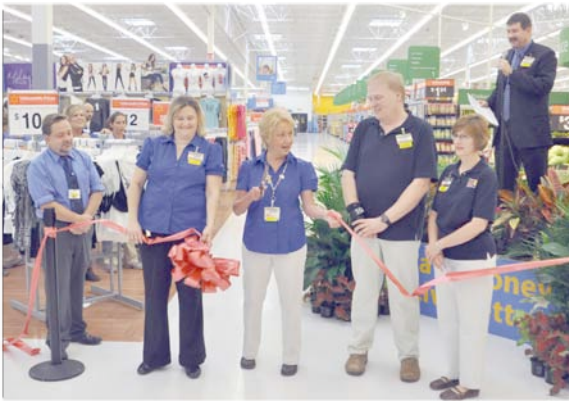
Algood Wal-Mart 589 W. Main St. Cookeville, TN 38506 (931) 537-3880