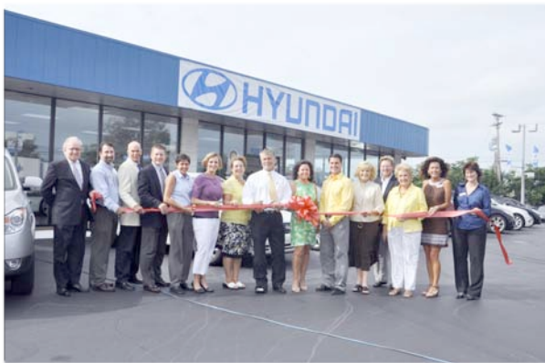
Hyundai 931 S. Willow Ave. Cookeville, TN 38501 (931) 520-7200