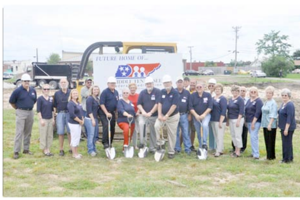
Middle TN Federal Credit Union 112 N. Oak St. Cookeville, TN 38501 (931) 528-9400