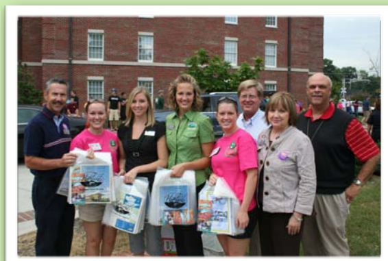
Chamber representatives and ambassadors, with the help of Tennessee Tech students, handed out Cookeville goodie-bags on Great Move-In day to incoming freshmen.