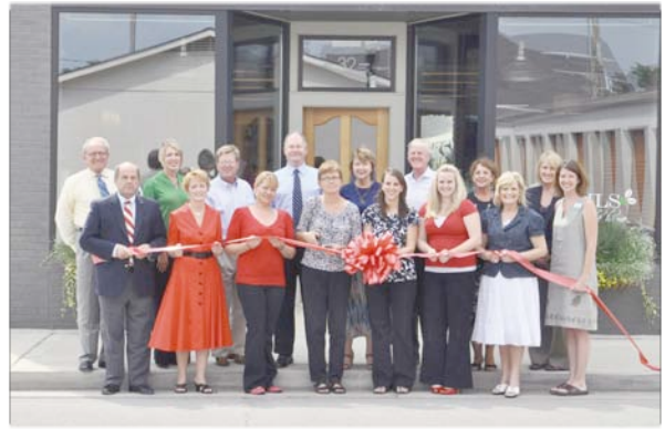
Details for the Home 32 N. Cedar Ave. Cookeville, TN 38501 (931) 528-1401