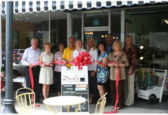
Poet's On The Square 230 E. Broad St. Cookeville, TN 38501 (931) 372-2201