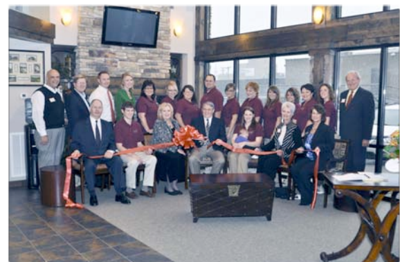
Johns Family & Implant Dentistry 121 S. Washington Ave, Cookeville (931)528-6547