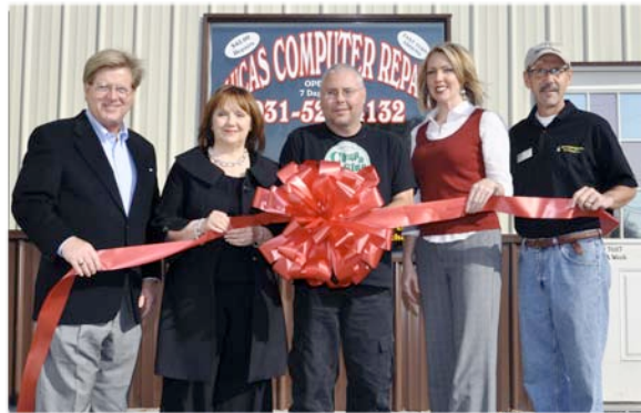
Lucas Computer Repair 2237 W. Broad St, Cookeville (931)528-4132