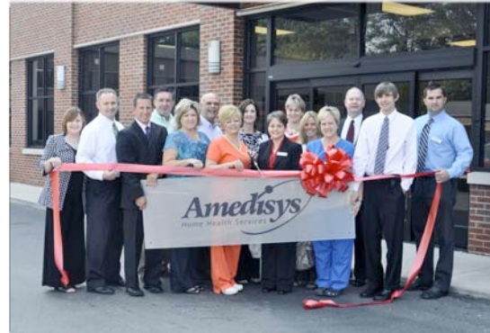
Amedisys Home Health 315 N. Washington Ave, Ste. 255, Cookeville (931)520-3005