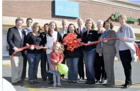
The Children's Place 377 W. Jackson St, Cookeville