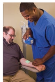
Patient and clinician using the VeinViewer.

Using near-infrared light projected onto the patient's skin, the device uses a digital video camera and an image processing unit to build a real time image that is painlessly projected onto the patient's skin, showing a visual roadmap to the patient's vessels. Using this image, clinicians are then able to easily locate the vein. The process is safe and uses no radiation in creating the image. Although this device can be used on any patient, it will typically be used at Cookeville Regional in the Surgery and Same Day Care Units as well as in special situations when a patient's vein access is difficult.