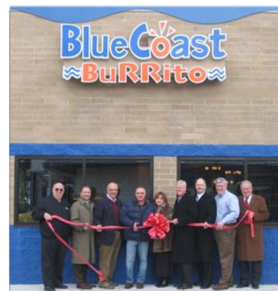
BlueCoast Burrito 1010 S. Jefferson Ave, Cookeville (931)525-2583