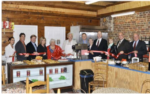
What's On The Menu 20 N. Cedar Ave, Cookeville (931)520-6368