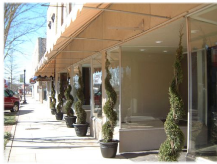
View of entrance to the shops at 39 W. Broad in Cookeville.

new, too! Watch for times and dates of specific events coming soon.