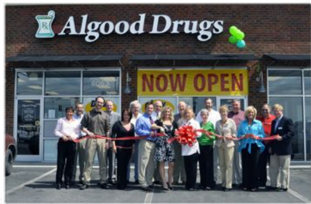
Algood Drugs 606 W. Main St., Algood (931) 537-3211