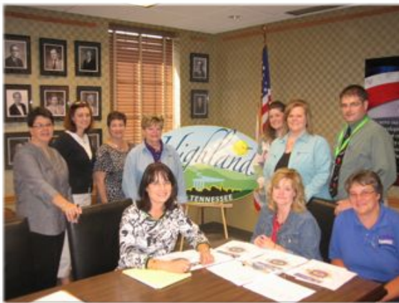
Highlands Career Fair Committee

The Highlands Workforce Development and Education Committee hosted an eighth grade career fair May 11 at Hooper Eblen Center on the campus of Tennessee Tech University. Approximately 1600 eighth grade students from Jackson, Overton, Putnam, and White county schools were in attendance.