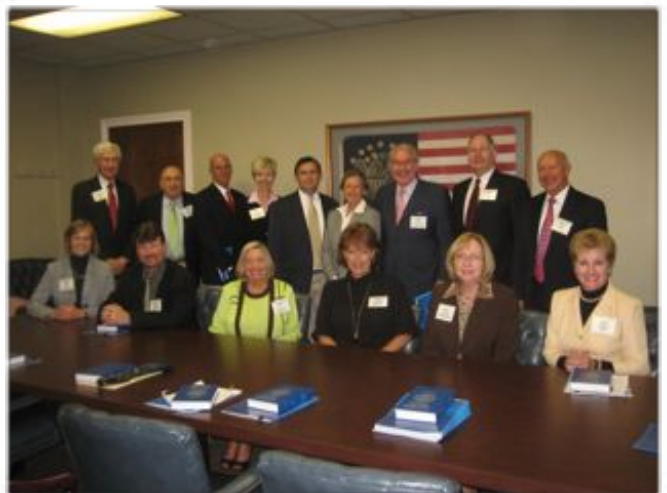
Meeting with State Senator Charlotte Burks